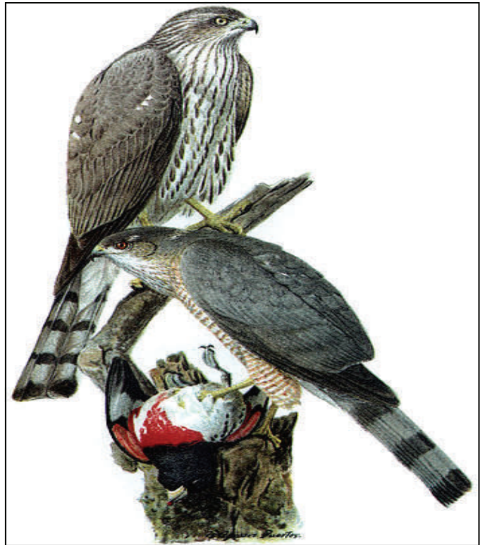
Permission (Reusing this image) Public domain—work of United States Federal Government