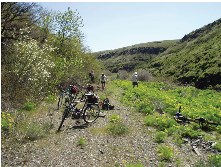
Bike work party in Swale Canyon, 2006

So far this year KTC volunteers have logged 415 hours!