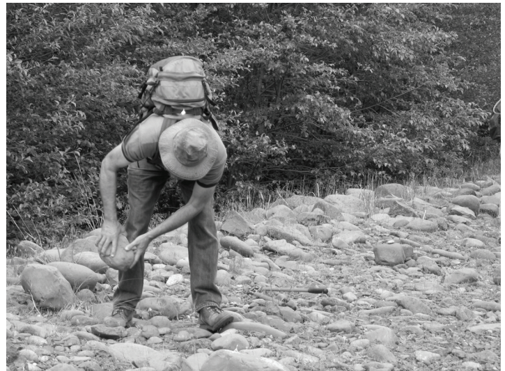
Rocks, rocks and more rocks