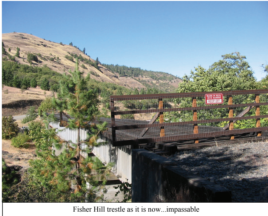
Fisher Hill trestle as it is now...impassable